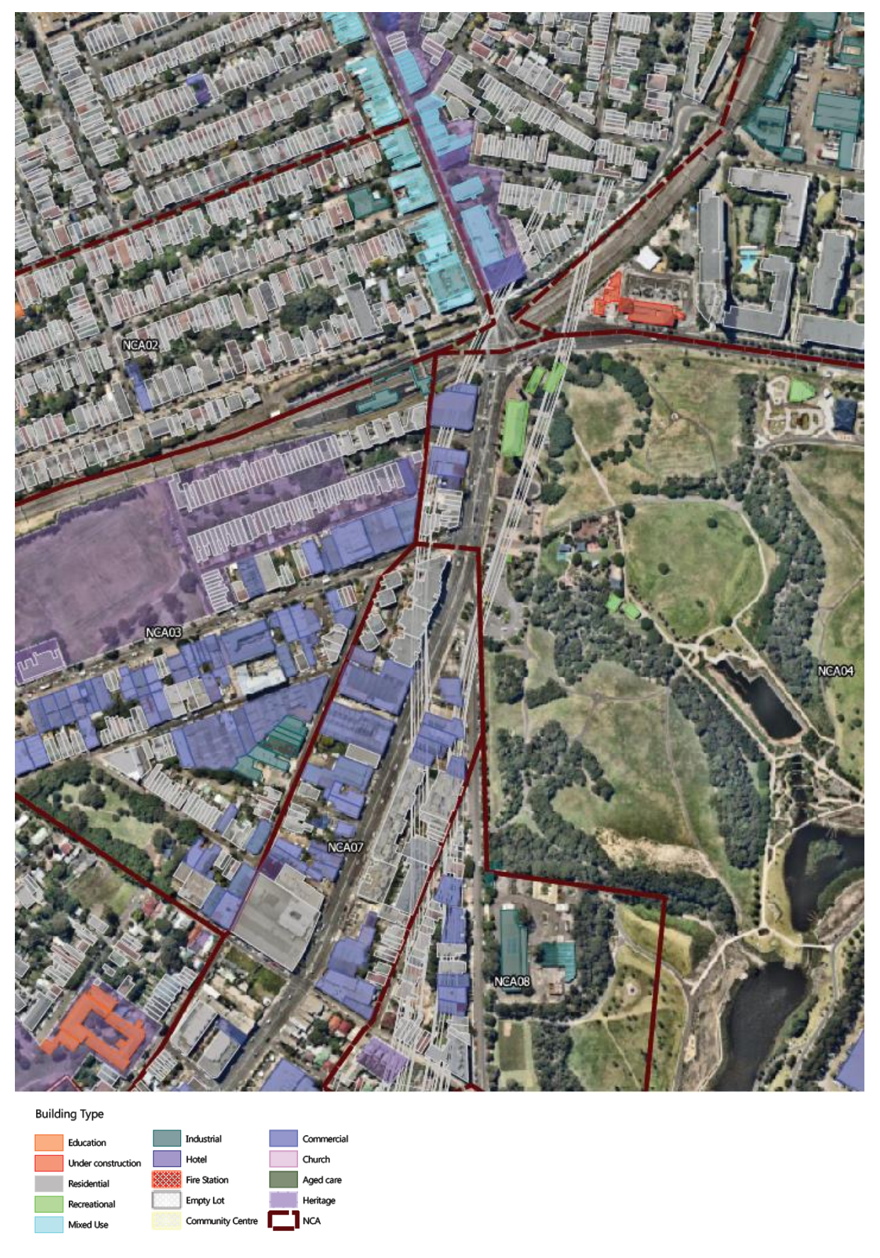
Figure 2 Land uses surrounding Barwon Park Road (extract from Construction Noise and Vibration Management Plan, Renzo Tonin & Assoc, 2016)