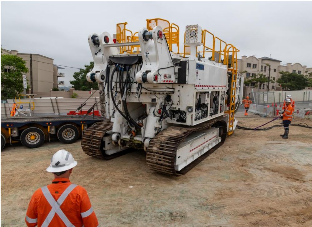
Image: the roadheader currently being assembled within our work site adjacent to Byrnes Street.

Assembly of the road header at Iron Cove is almost complete and tomorrow we'll be moving it towards the cut-and-cover within our worksites adjacent to Callan Street. This roadheader will be used to excavate the ventilation tunnel and caverns. You can watch the road header being moved through the viewing windows located at the pedestrian pathway adjacent to Toelle Street.