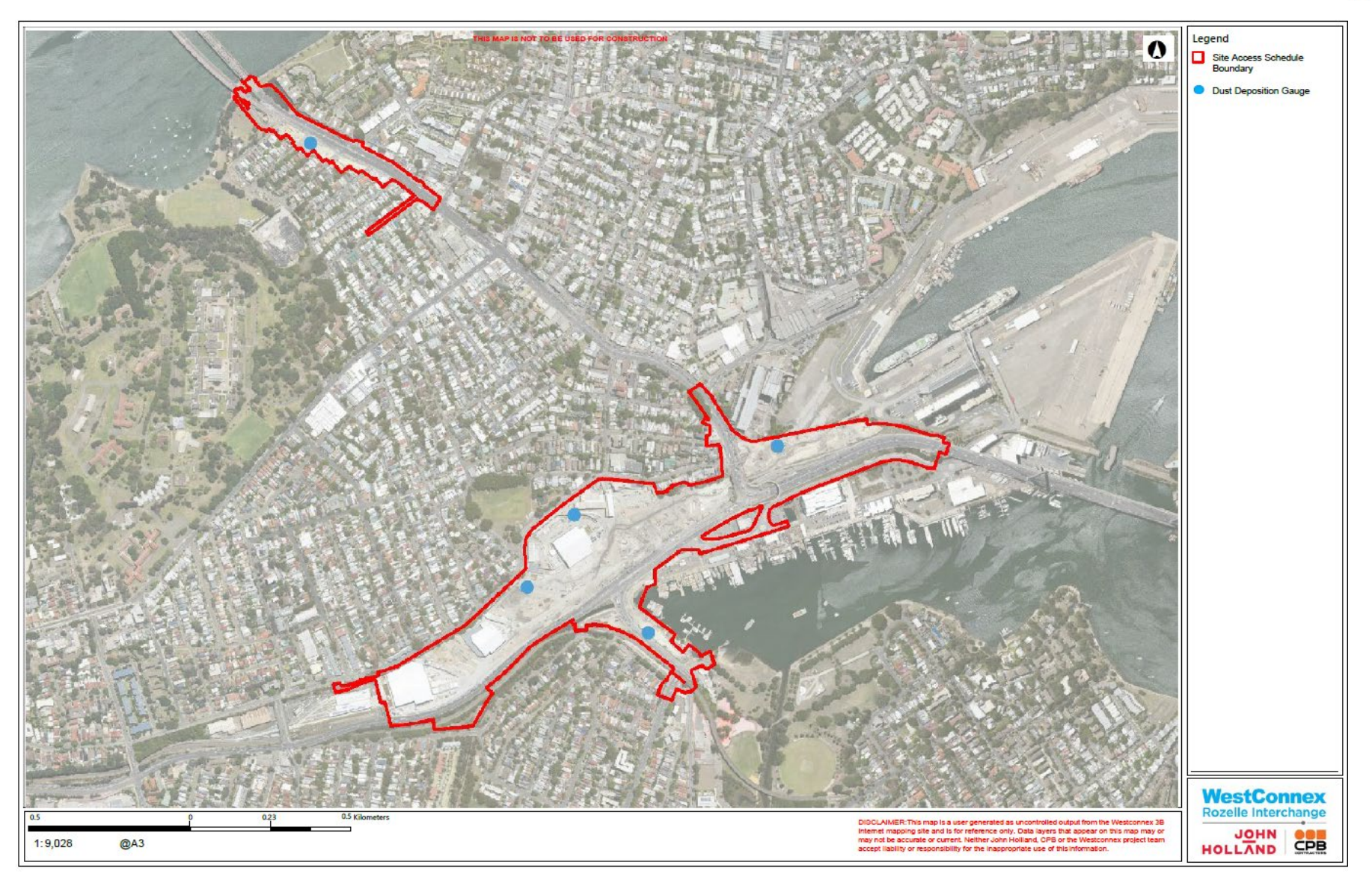
Figure 1 Proposed Dust Deposition Gauge Locations