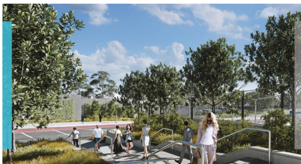
Image: Artist's impression of the complex view from Terry Street