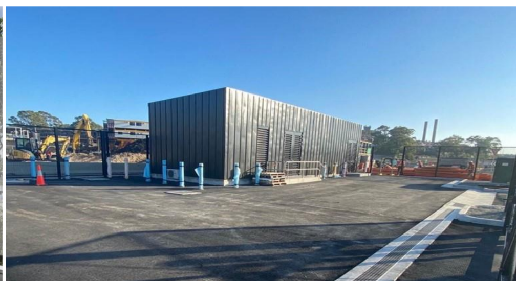
Image: Example of a similar building being built at the Rozelle Rail Yards