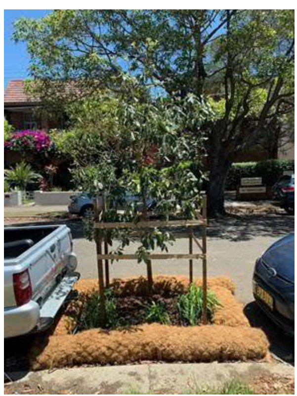
20 Tintern Road, Ashfield