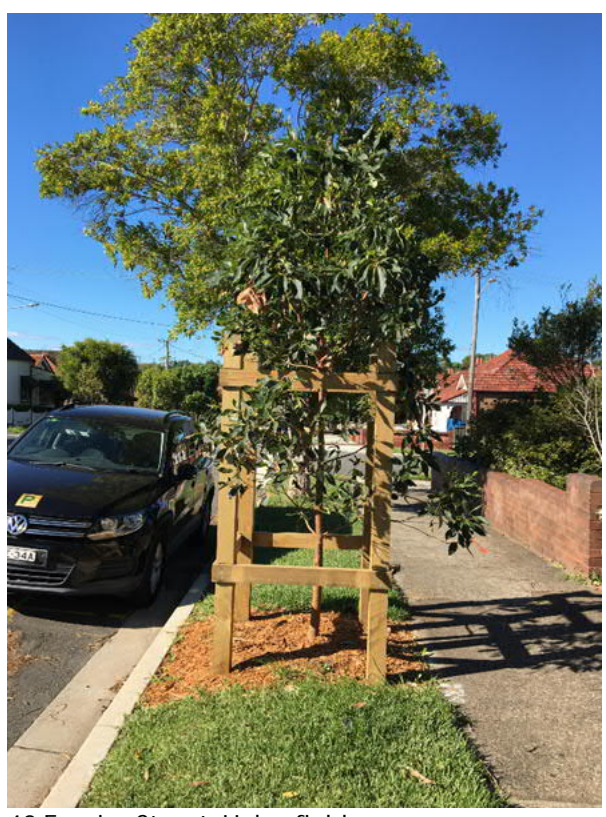
42 Empire Street, Haberfield