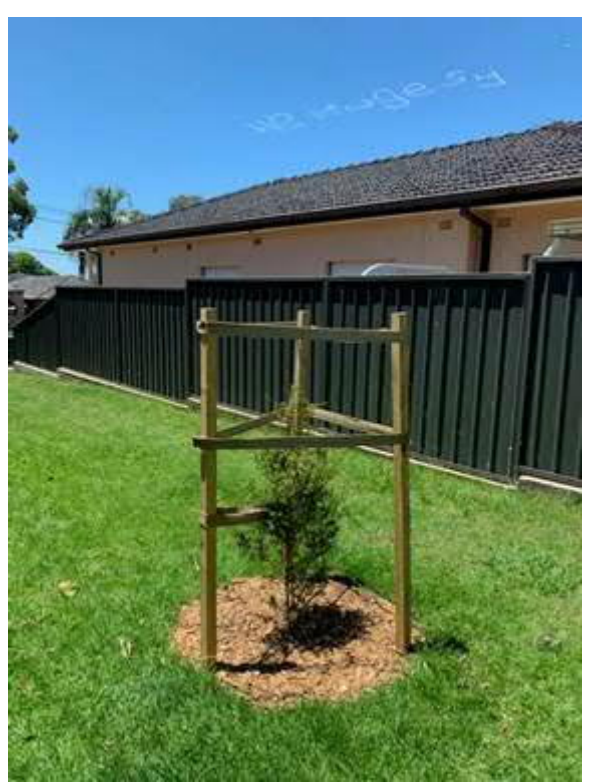
10 Kenilworth, Croydon