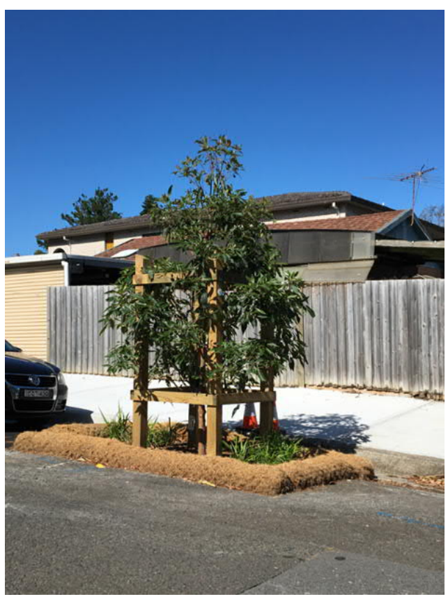
113 Holborow Street, Croydon