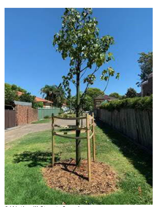
2 Wetherill Street, Croydon