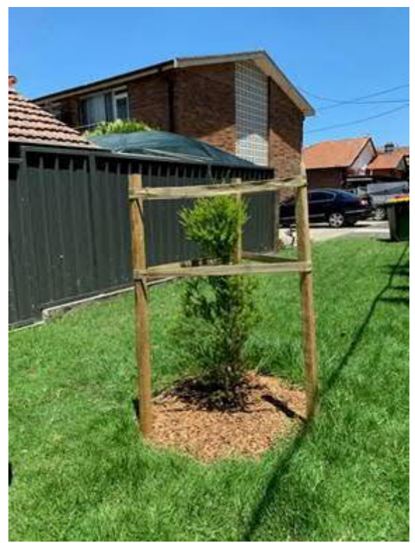
10 Kenilworth, Croydon