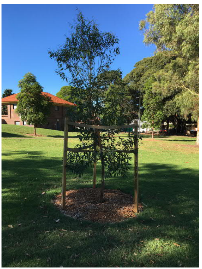
Ashfield Park (Opposite 76A Orpington St, Ashfield)