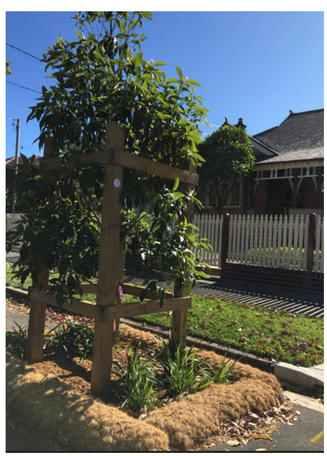
14 Hampden Street, Ashfield