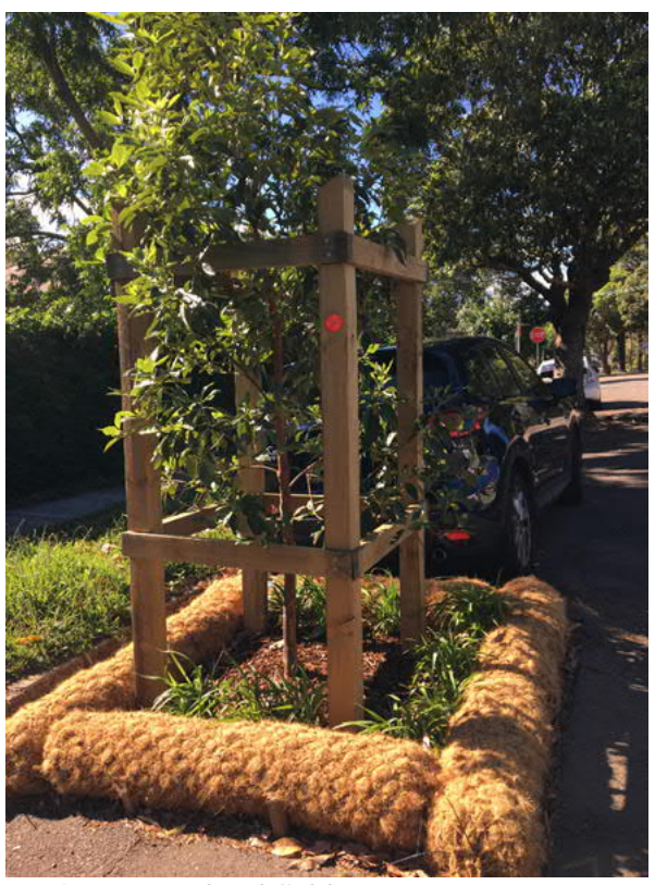
52 Tintern Road, Ashfield