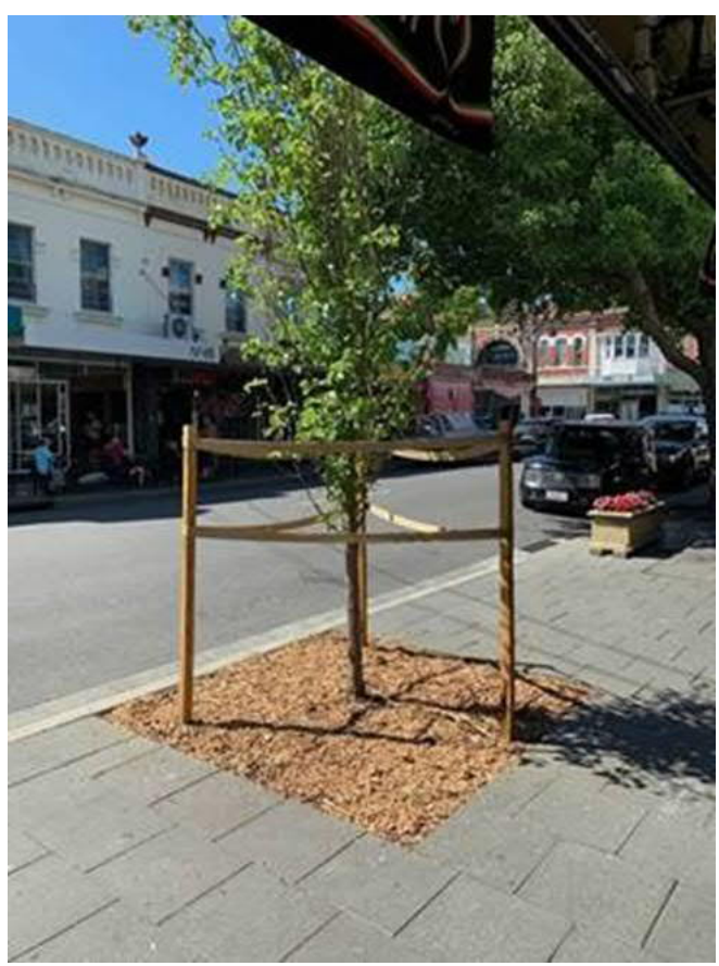
29 Lackey Street, Summer Hill