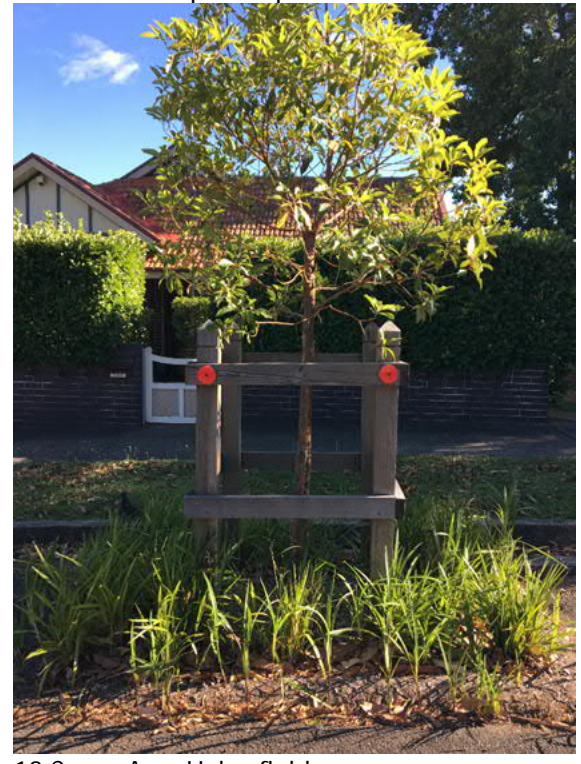
12 Crane Ave, Haberfield

Below are completion photos of each tree location: