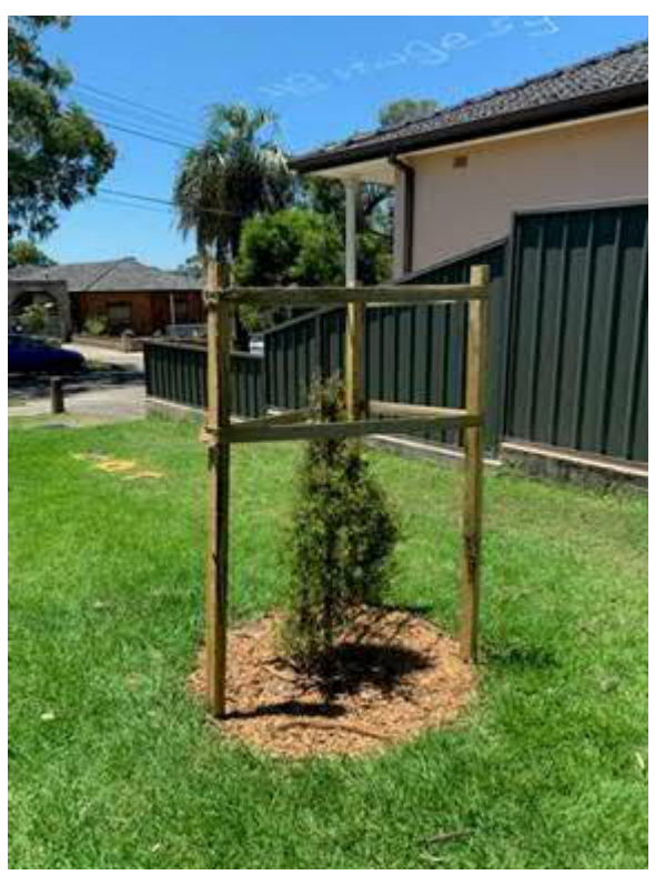
10 Kenilworth, Croydon

Please confirm if you require a site walkover to inspect or if you are happy to sign off the attached schedule 9 certificate of completion. We will continue to maintain these locations for 12 months in accordance with Section 4 - Tree Establishment & Maintenance of the Street Tree Supply & Installation Specifications.