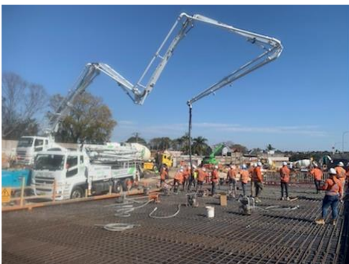
Image 1: The concrete is pumped from the concrete truck into the steel framework

Last week we constructed a roof for the cut-and-cover structure between Toelle and Callan streets. We poured 360 cubic metres of concrete into the steel framework to create 13 support beams and a surface roof slab, which will eventually support the new traffic lanes (for vehicles heading towards Drummoyne) on Victoria Road.