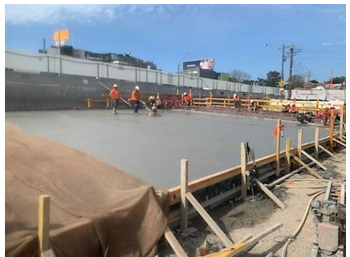
Image 2: The concrete has been poured, smoothed and is left to cure