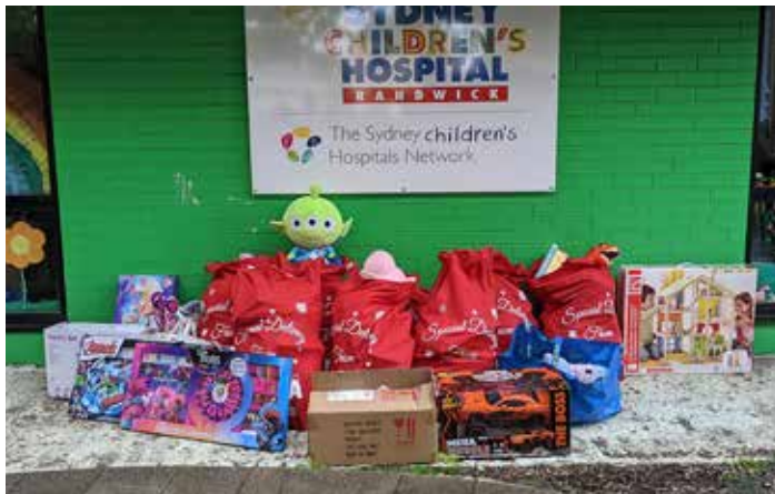
Christmas toy collection for the Sydney Children's Hospital in Randwick

In the lead up to Christmas, the M4-M5 Link Tunnels Project spread the word and quickly gathered up toy donations for the Sydney Children's Hospital in Randwick. The donation drive was driven by one of the Project's site foremen at the St Peters site. The Project collected over eight Santa sacks filled with toys, educational aids and gift cards which were delivered to the hospital on 18 December 2020 to be shared with babies, children and young people who were spending their Christmas in hospital.