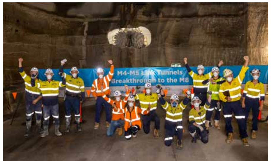
Tower crane at the Campbell Road site in St Peters and the Campbell Road site / M8 breakthrough photo taken on 31 January 2021