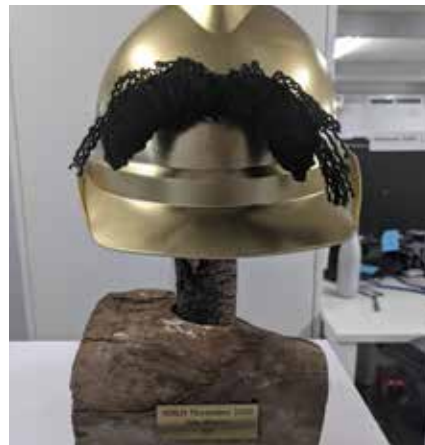
Movember 2020 winning trophy

A site-versus-site competition to raise money and awareness for men's health as part of Movember 2020 was run across all Project sites. Teams from Haberfield, Camperdown/Annandale, St Peters and Mascot participated in a number of fun and inclusive activities to encourage the difficult conversation that Movember advocates for, such as mental health and suicide prevention, prostate cancer and testicular cancer. By the end of November 2020, the sites raised just under $10,000 for the worthy cause. The St Peters team raised the most money and therefore took out the shiny Movember Mo-phy (trophy).