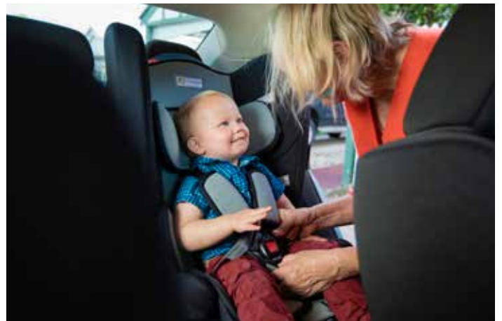
Kidsafe car seat fitting demonstration

WestConnex | Transurban is thrilled to support 25 local organisations through the most recent round of community grants. The initiatives chosen will directly benefit more than 19,000 people and indirectly benefit almost 52,000 people across the WestConnex corridor. Newtown Public School received funding for a new adventure playground and Kidsafe NSW will be able to offer their accredited child car seat training course to support vulnerable families at Stretch-A-Family, Good Shepherd and YWCA in the Inner West. The next round will open on Monday 29 March 2021 - visit www.westconnex.com.au/community