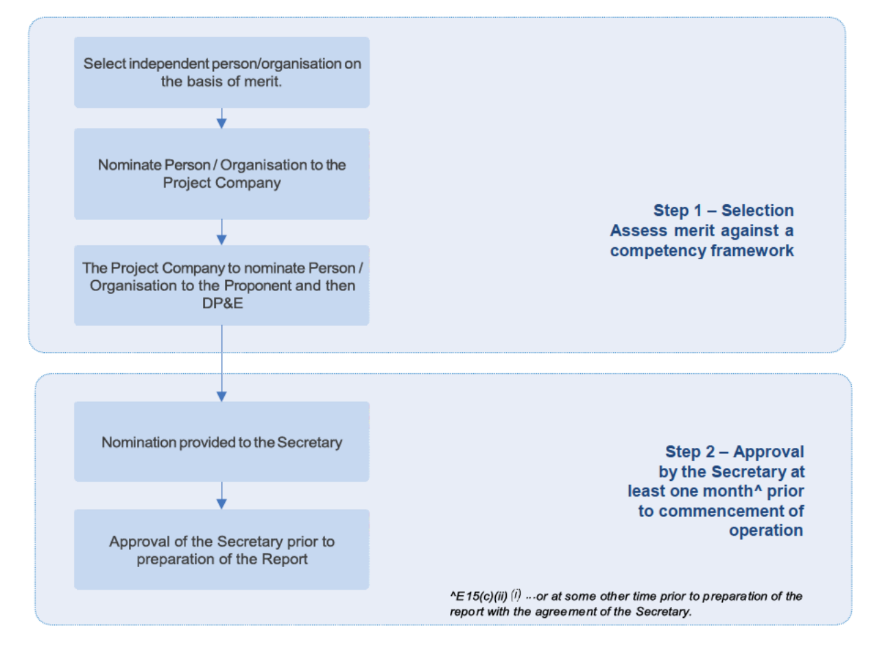
Figure 8 - Process of Appointment

The process for appointing an independent person/organisation to prepare the Report on Above-Goal Reading is as follows: