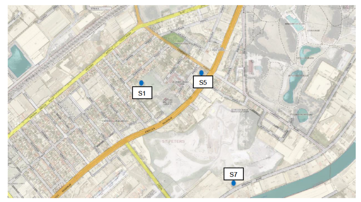
Figure 3 - Ambient air quality monitoring stations to be located at near St Peters Ventilation outlet, E10(c+d)