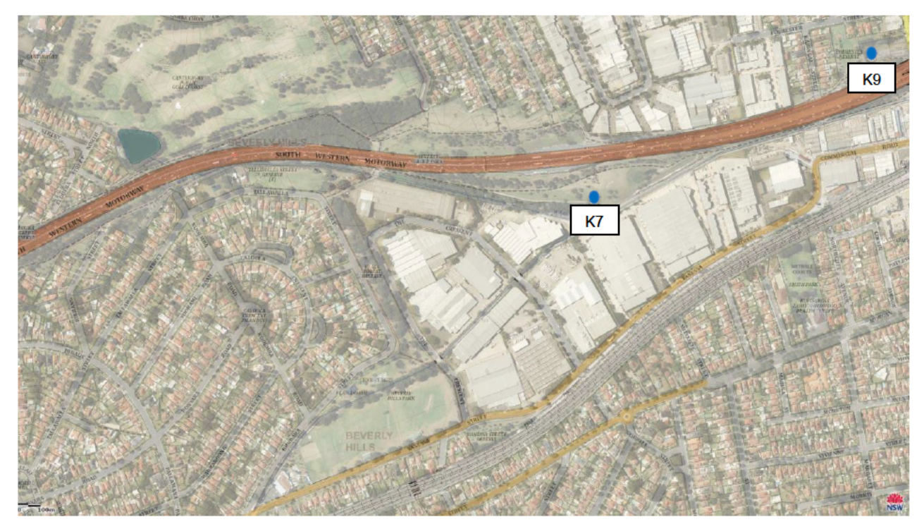
Figure 1 - Ambient Air Quality monitoring stations to be located near Kingsgrove ventilation outlet, E10(a)