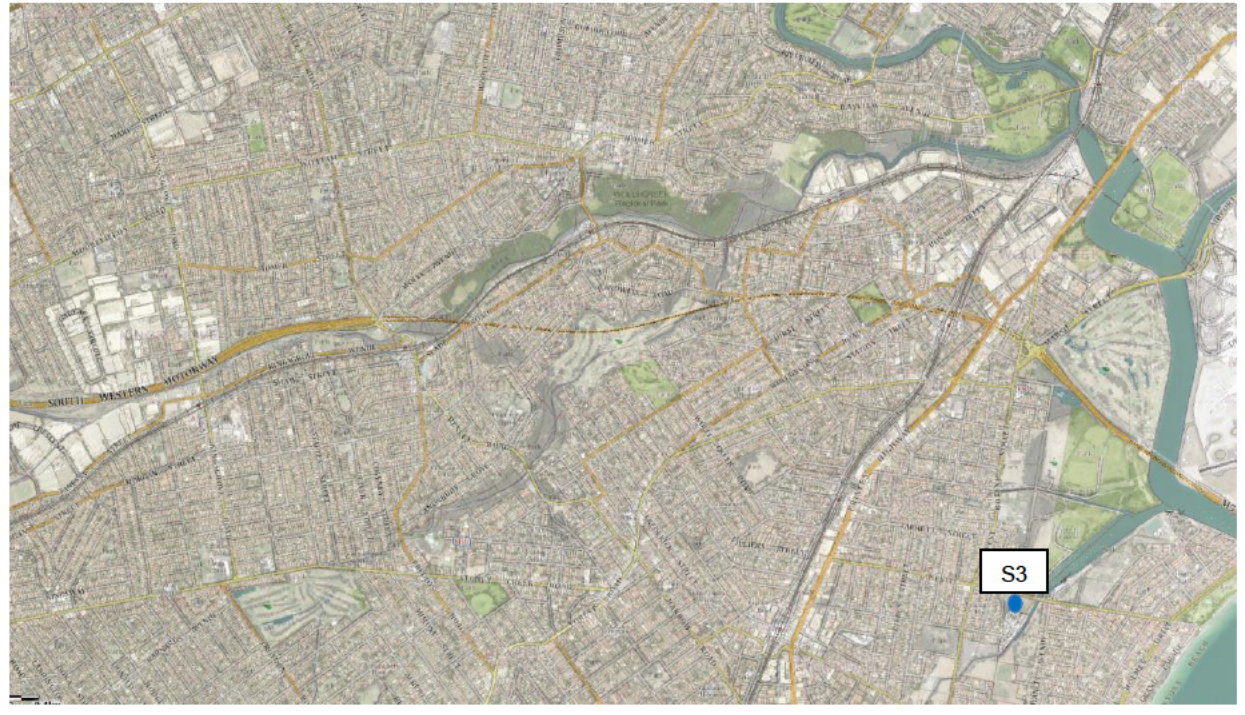
Figure 4 - Ambient air quality monitoring stations to be located away from any of the locations at E10(a-d), E10(e)