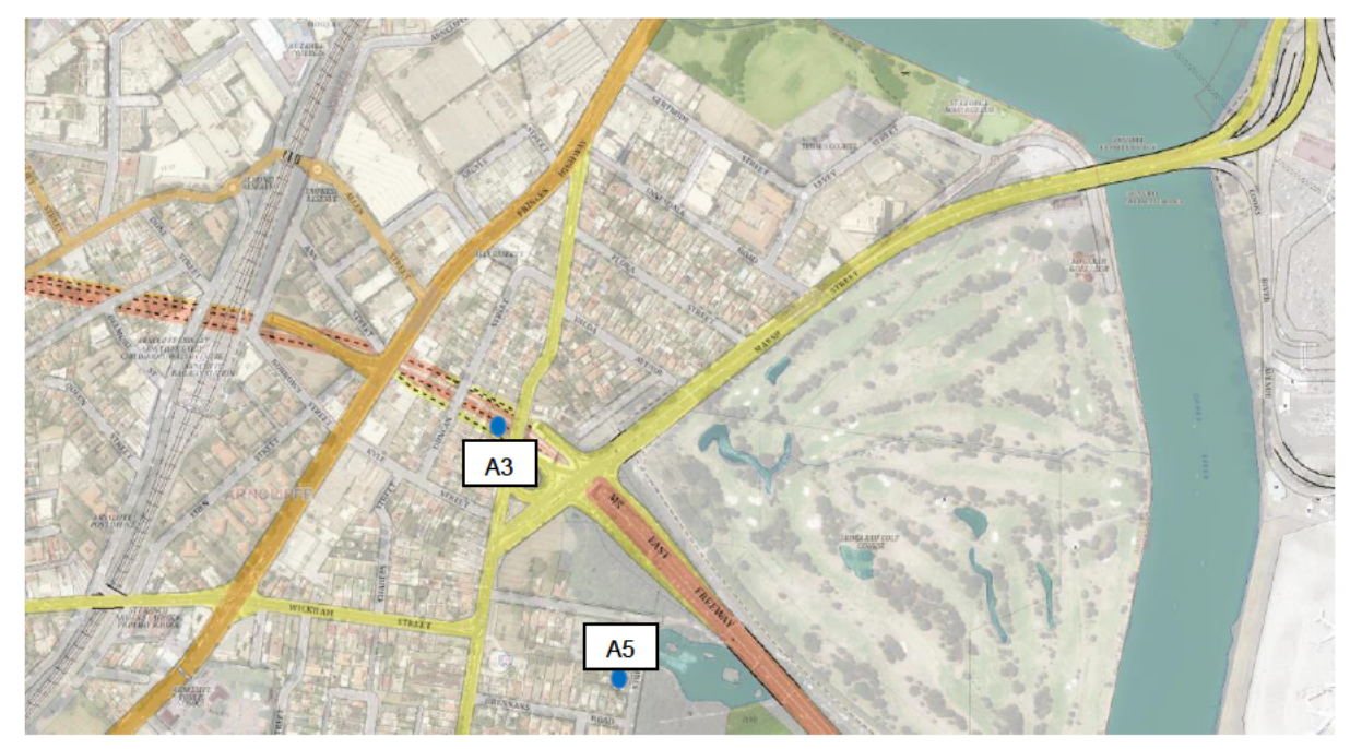
Figure 2 - Ambient Air quality monitoring stations to be located near Arncliffe ventilation outlet, E10(b)