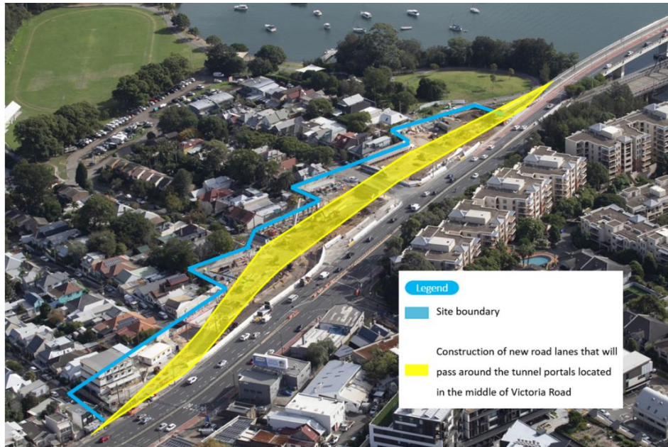
This map shows the current location of construction for new road lanes that will pass around the tunnel portals located in the middle of Victoria Road