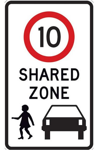
For the safety of pedestrians, cyclists and motorists, please obey signage like this on Callan Street.

The below map outlines the traffic changes next week.