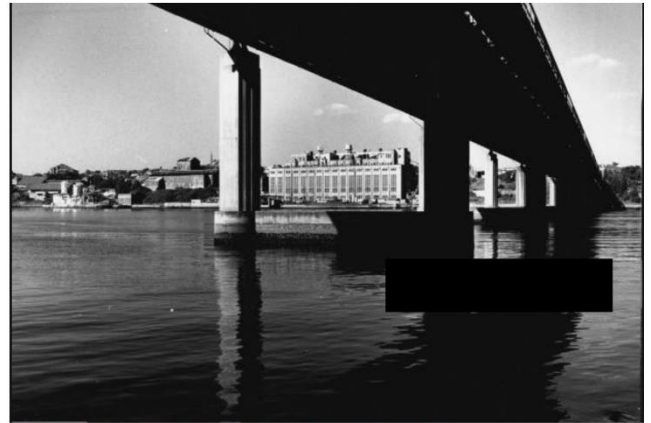
The Balmain power station seen from below the Iron Cove Bridge