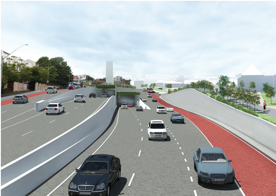
Artist's impression of Iron Cove Link 12 to 18 months after completion

WestConnex is part of the Australian and NSW governments' vision for supporting Sydney's growing population and keeping our economy strong. The M4-M5 Link is the third stage of WestConnex. It will link the New M4 Motorway at Haberfield to the New M5 Motorway at St Peters, with additional connections to the Iron Cove Bridge and Rozelle Interchange.