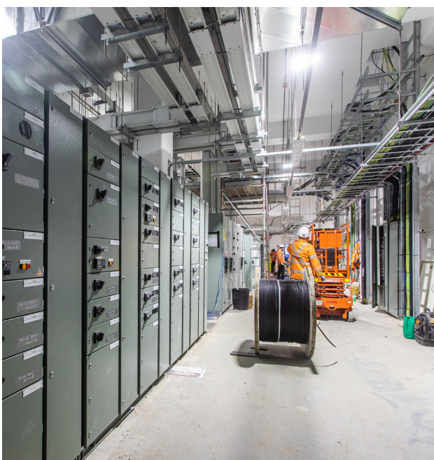
Electrical substation in St Peters

The Mechanical and Electrical team achieved a significant milestone in October, with the substation located at St Peters Interchange being energised. The substation at St Peters Interchange is just one of six substations that will be energised over the coming months.