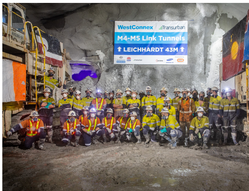
The Haberfield excavation team following the breakthrough