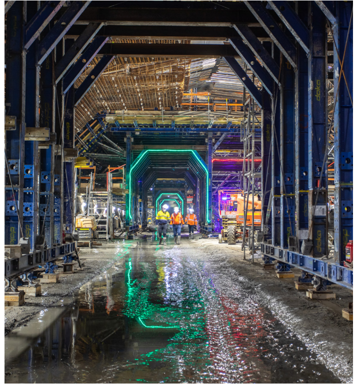
Bridging support slab construction in Leichhardt

The mechanical and electrical fit out, which includes installing lights, fans, signs and other electrical equipment, has progressed significantly, with nearly 80% of the tunnel handed over to these teams.