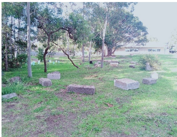
Sandstone blocks in their final position

Earlier this year, the Project donated a large number of heritage sandstone blocks to Wilkins Public School in Marrickville. The blocks previously made up the façade of the former Bank of NSW on Parramatta Road, Annandale and have now been integrated into the landscaping on the school grounds for the students to use during their free time. The blocks were placed into their final position during the holidays, just in time for the children's return to school.