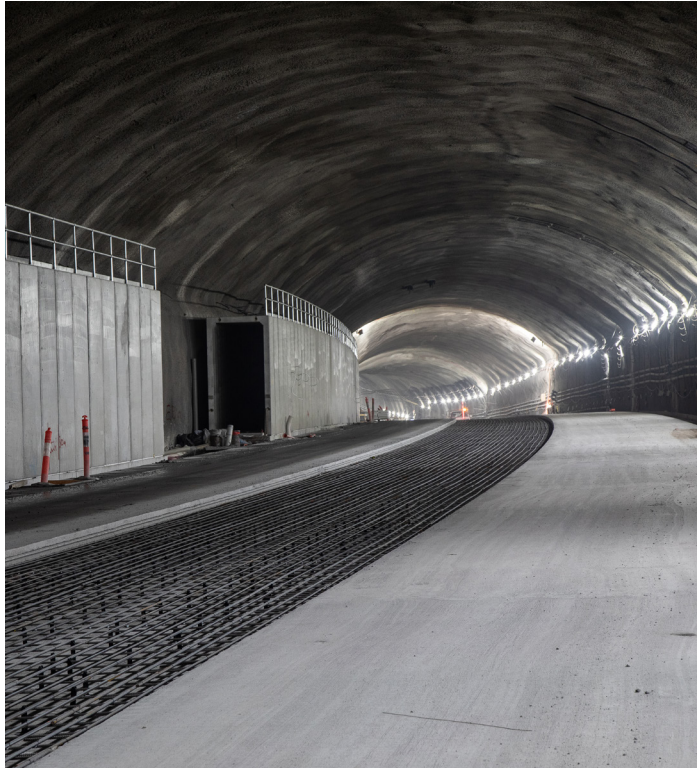
Paving progress for new traffic lanes in the mainline tunnels

More than 16,000 cubic metres of pavement has been installed in the tunnel. To date, the project has placed over 500,000 m 3 of concrete, which includes shotcrete, and is about 88% of the total concrete required for the project.