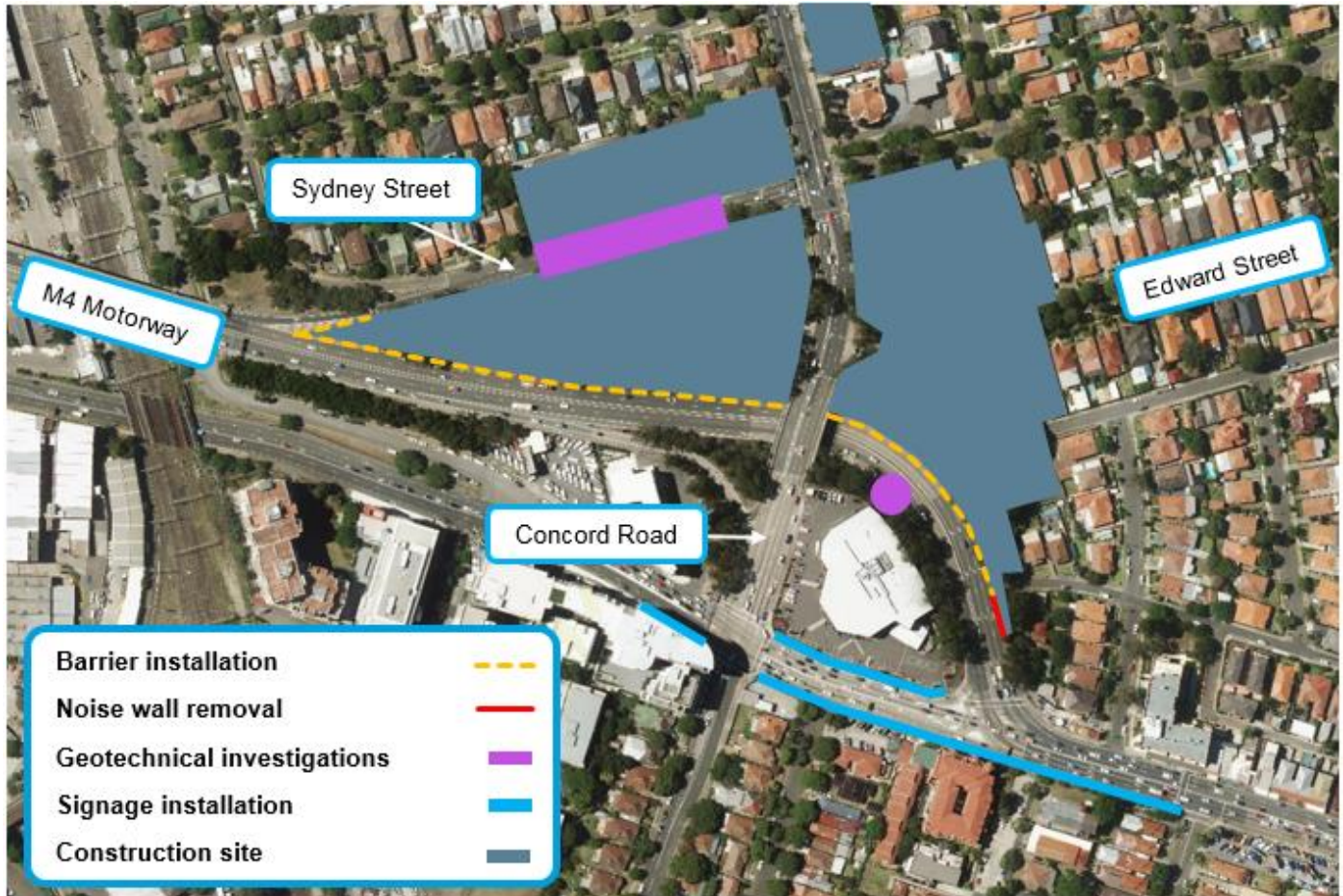
AUSIMAGE © Jacobs Group (Australia) Pty Ltd