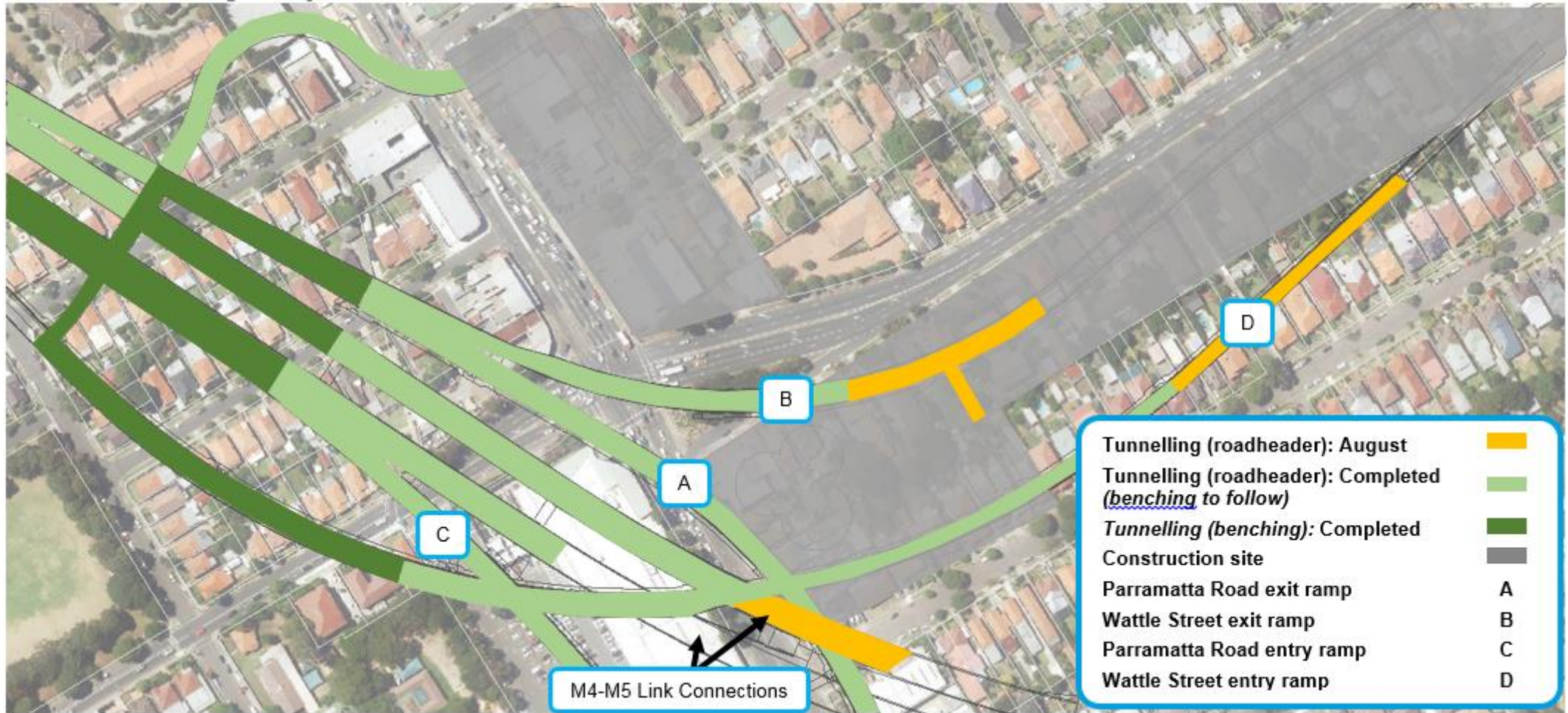
Location of tunnelling activity – Northcote Street construction site.