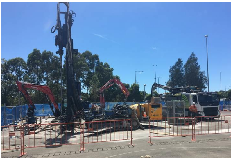
Drilling rig and support excavator